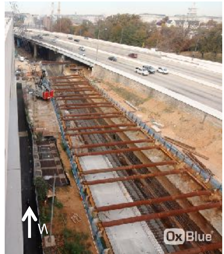
Invert and Walls Complete Precast Roof Soffits Installed