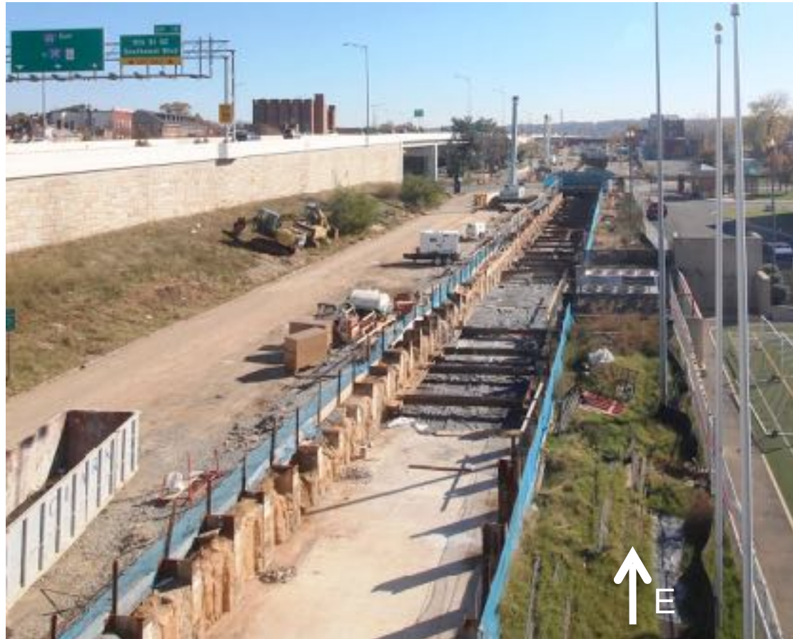
Roof Units Poured