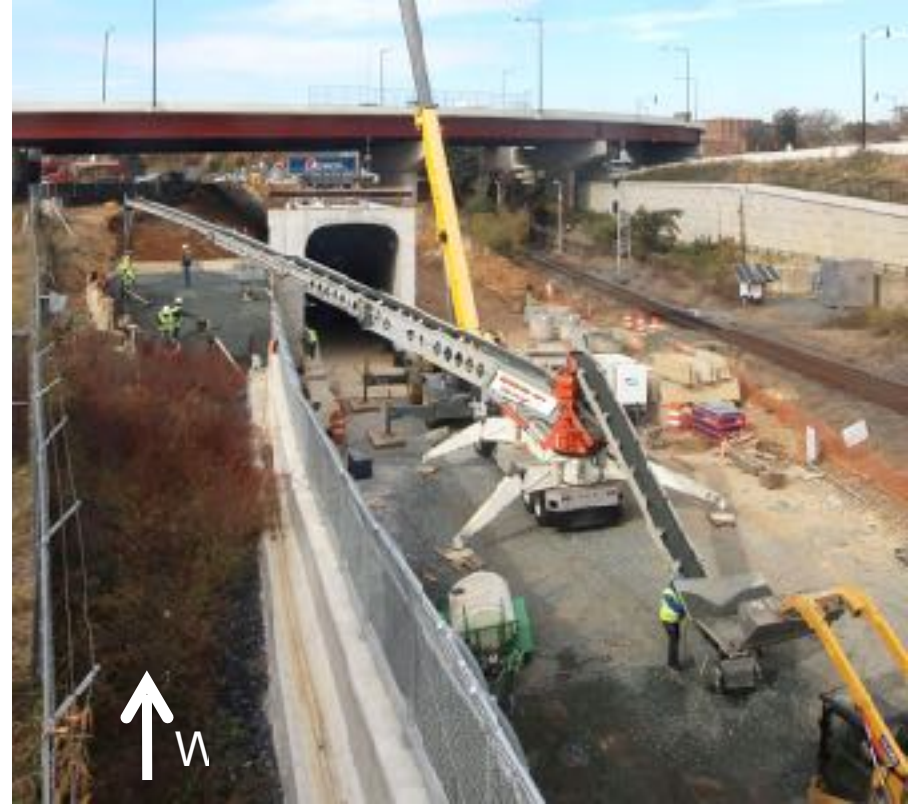
East End Portal