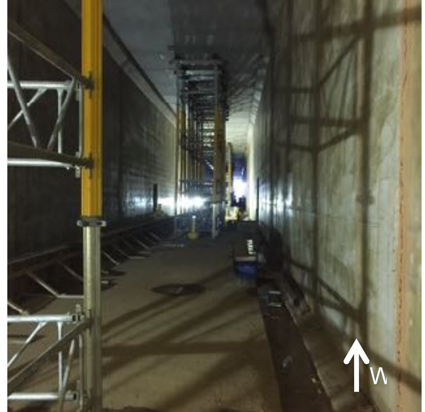
Supporting the Roof Pours