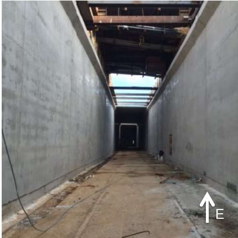
Walls Complete at 8th St.