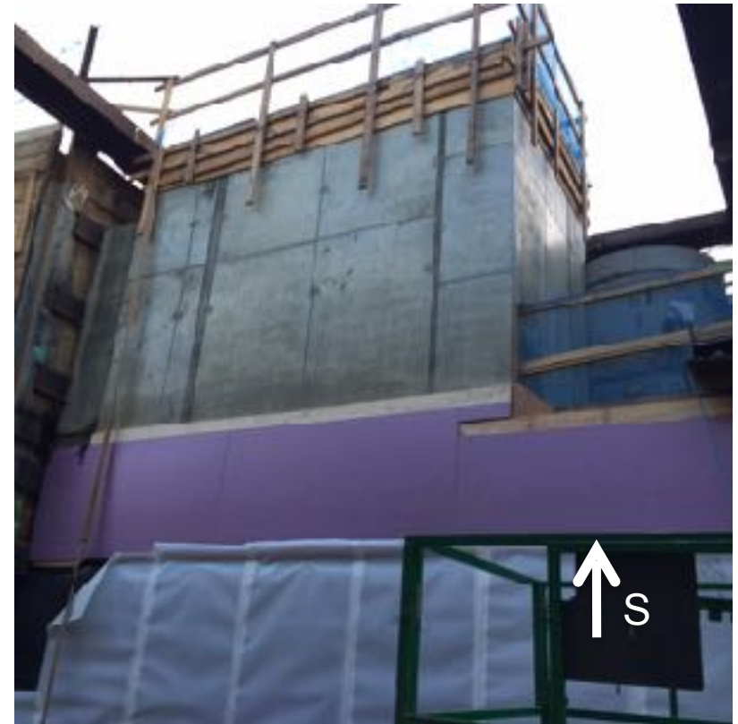
6th St. Siphon