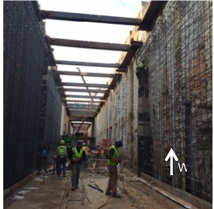
Preparing for Wall Pours