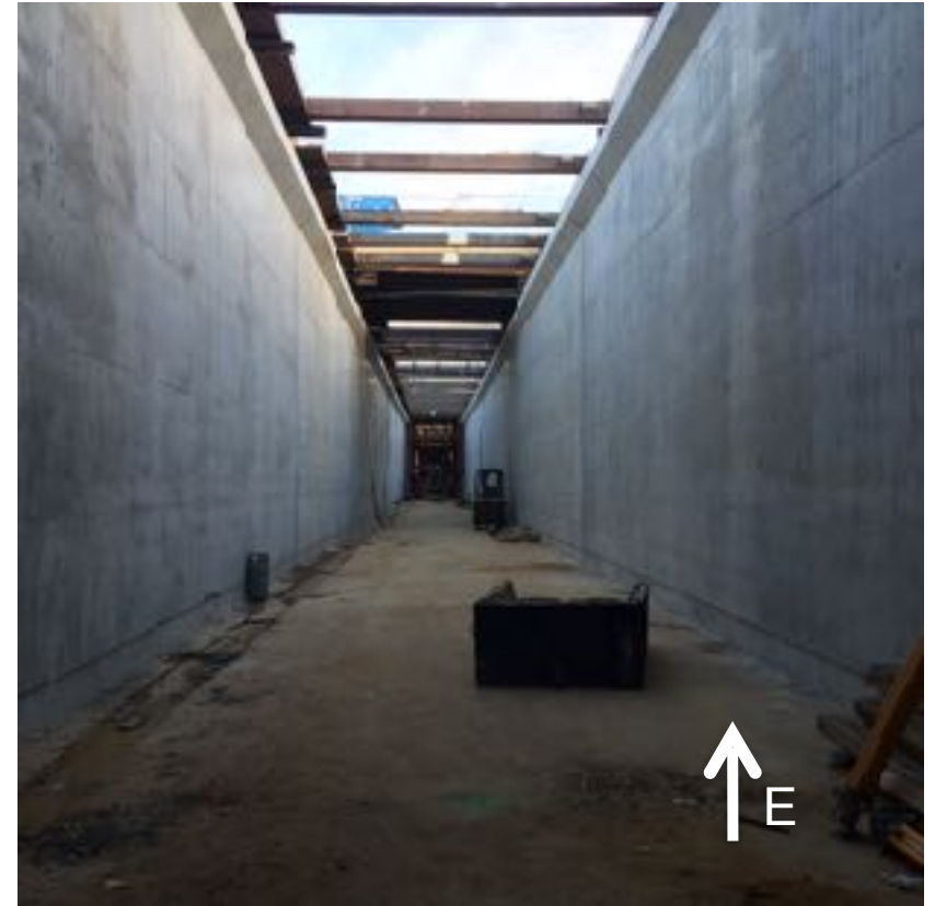
Ready to Precast Roof Soffits