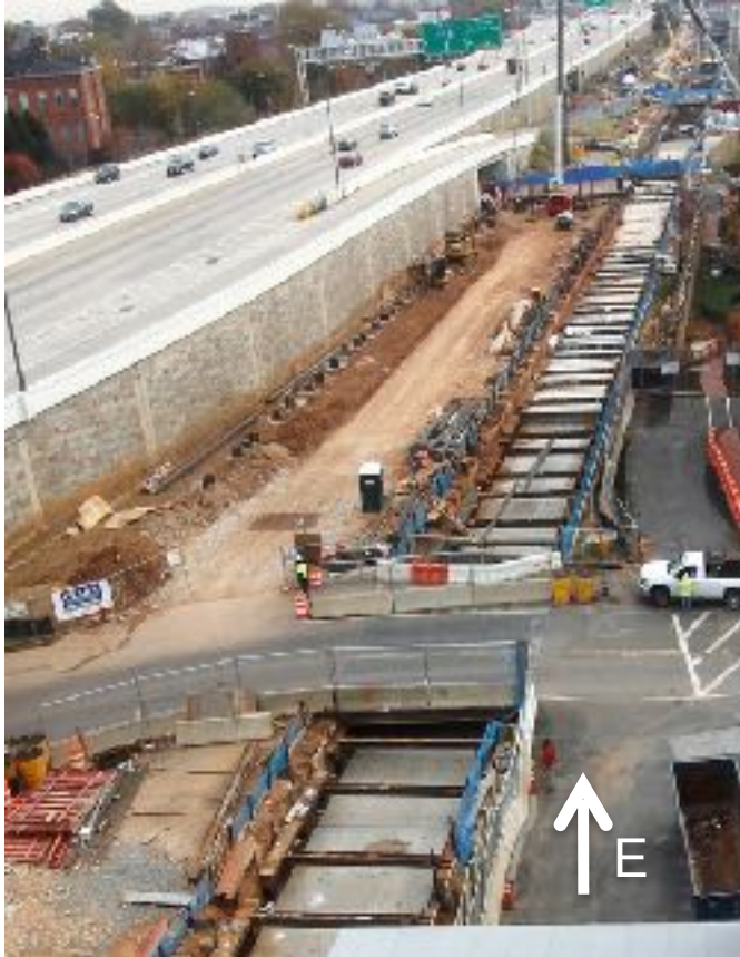
Tunnel Roof Pours