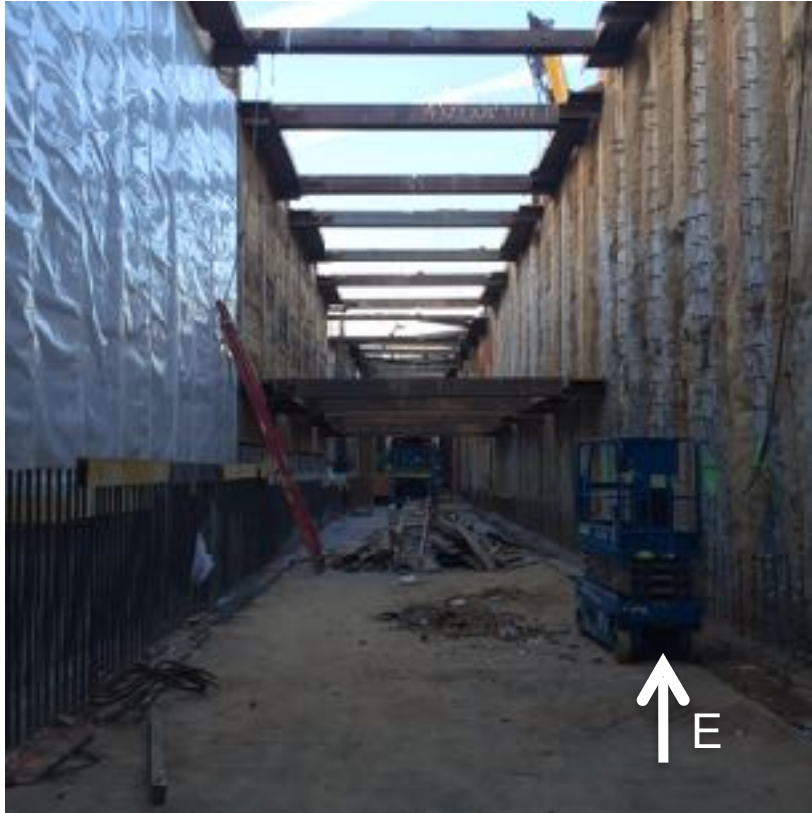
Preparing for Wall Pours