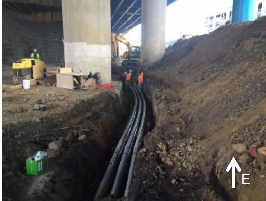
Duct Bank Installation

Retaining Wall, Duct Bank, Drainage, and Roadbed Construction