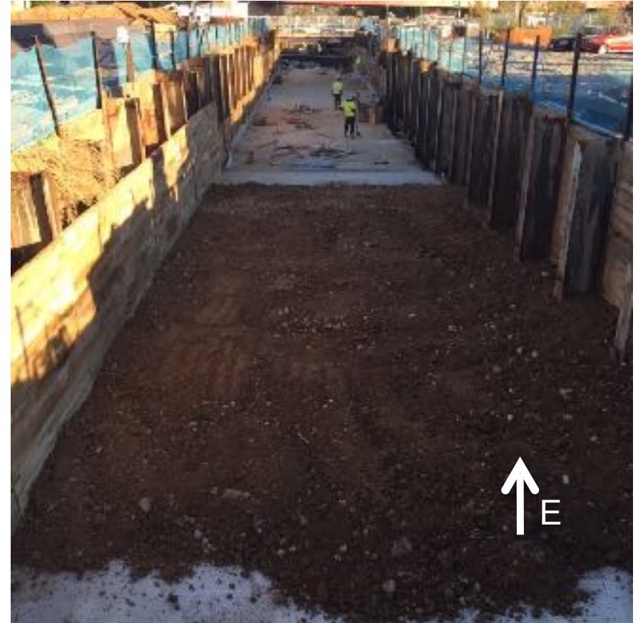
Backfilling Has Started