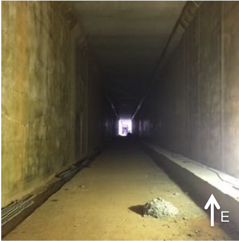
Duct Bank Complete