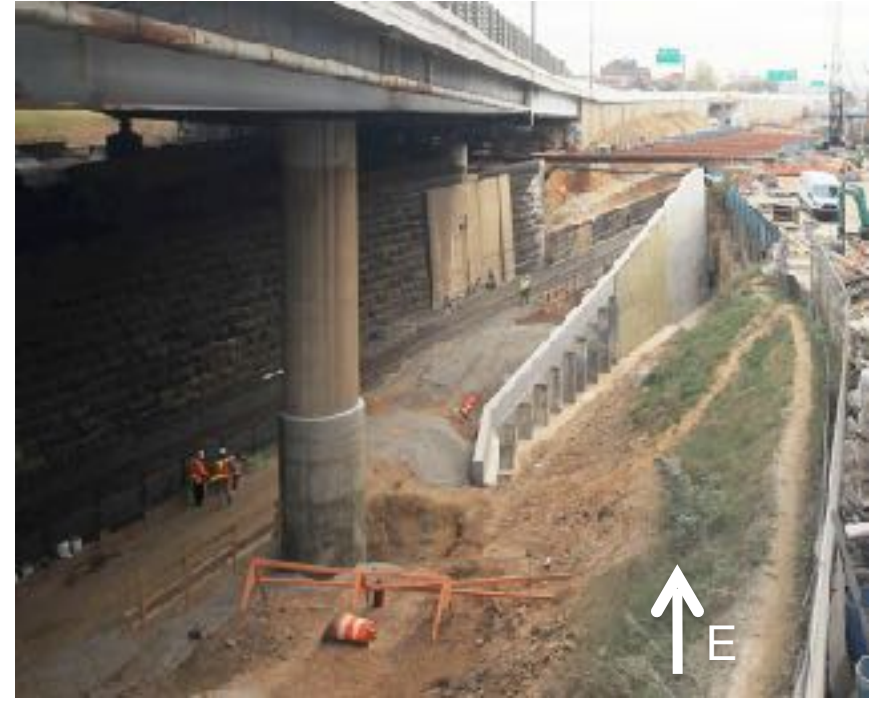
Retaining Wall Complete