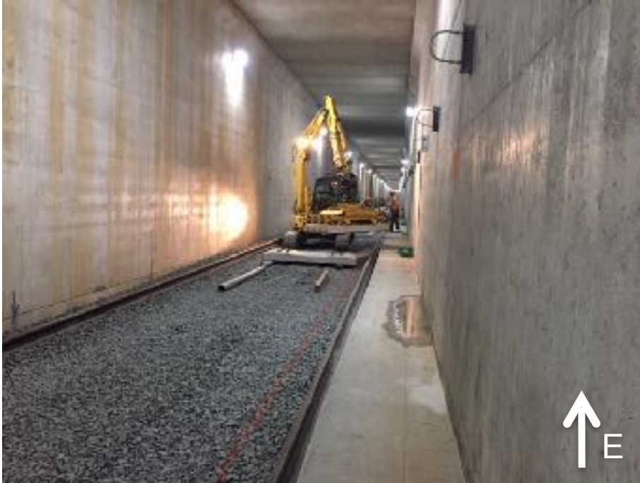
Laying out Ties in the Tunnel