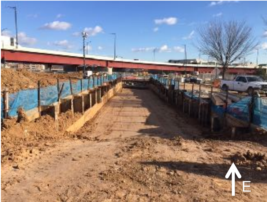
Backfilling Phase I Tunnel