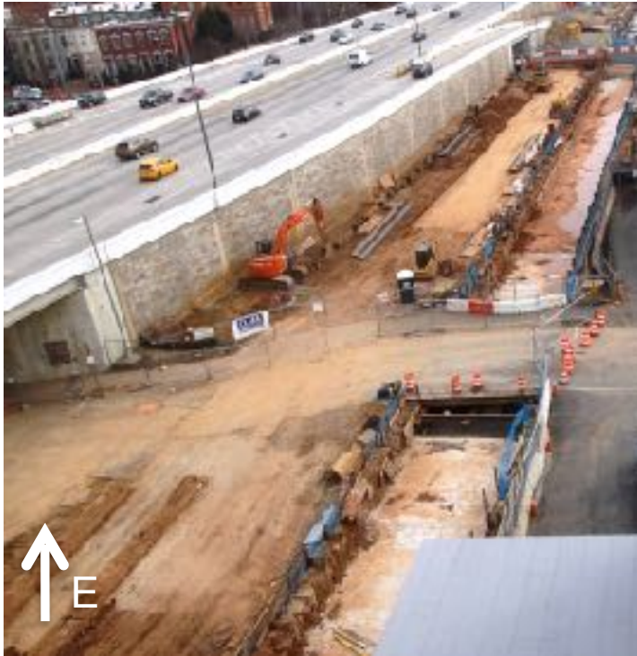
Preparing to Install Phase II Bridge Deck at 3 rd St.

Tunnel and Track Construction / Phase II Bridge Decks and SOE Piling