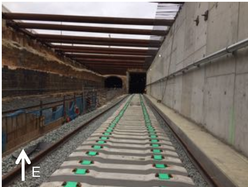
Ties in Place - Ready for Rail