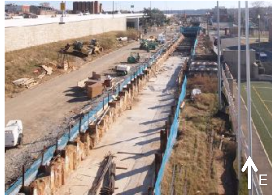
Pouring Roof Caps