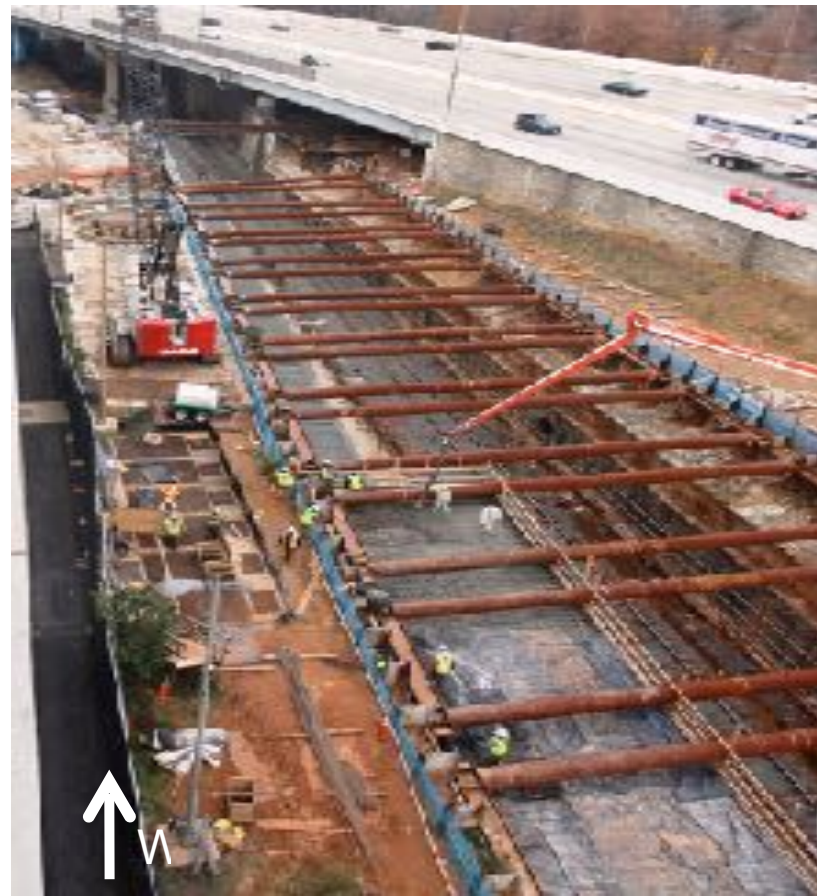
Pouring Concrete Roof Cap