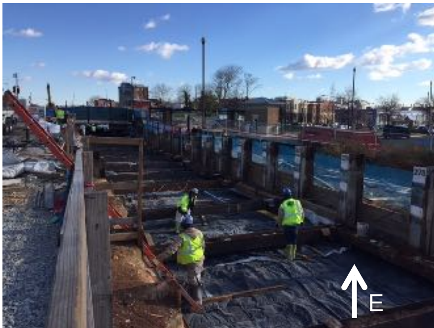
Pouring Roof Caps