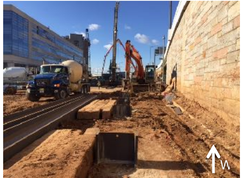
Phase II Support of Excavation Piling