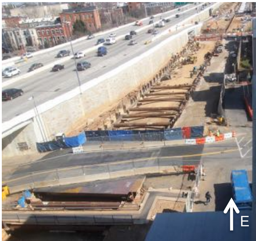
3rd Street Bridge Deck

Backfilling Phase I, Excavating and Installing Support of Excavation for Phase II, 3rd St. Bridge Deck