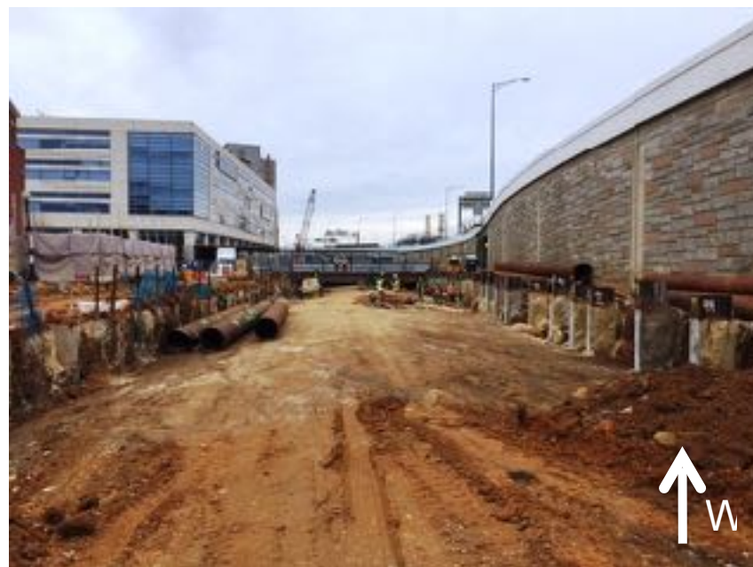
Excavation to Expose Old Tunnel Arch