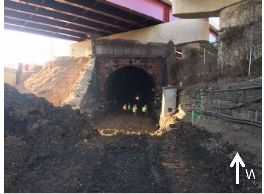
Preparing for Old Tunnel Support Installation