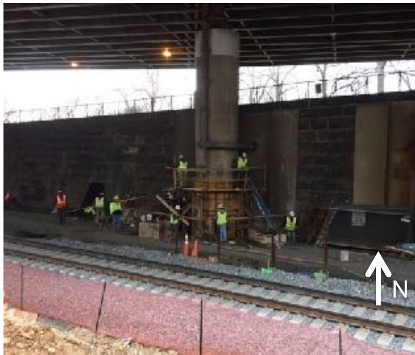
Pouring Concrete Column Protection

Removal of Old Track, Concrete Column Protection, and Backfilling