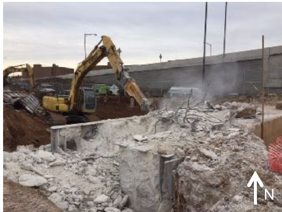
Demolition of Straddle Bent Footing