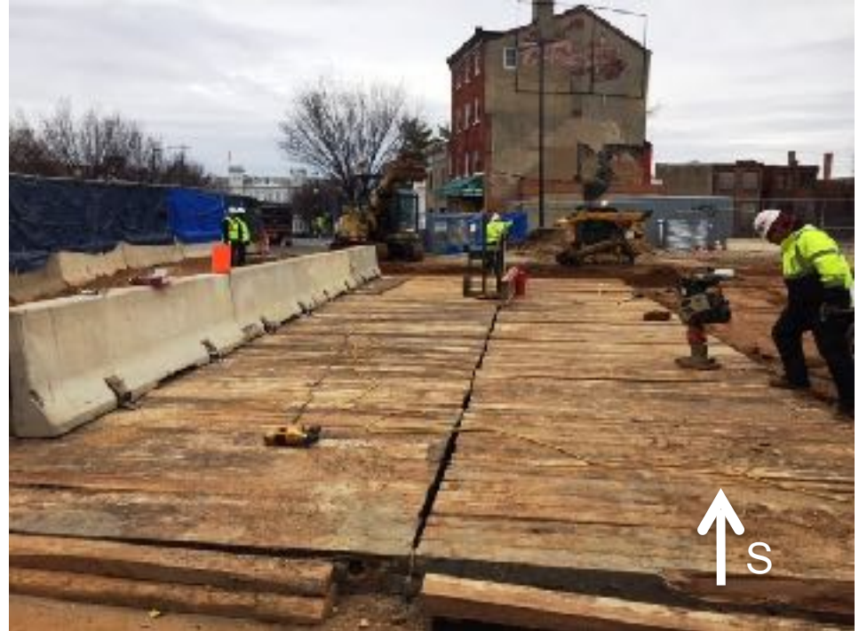
8th Street Phase II Bridge Construction