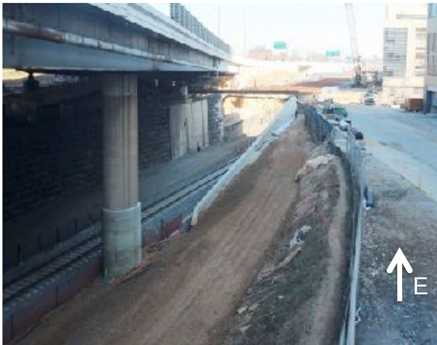
Backfilling to H St.