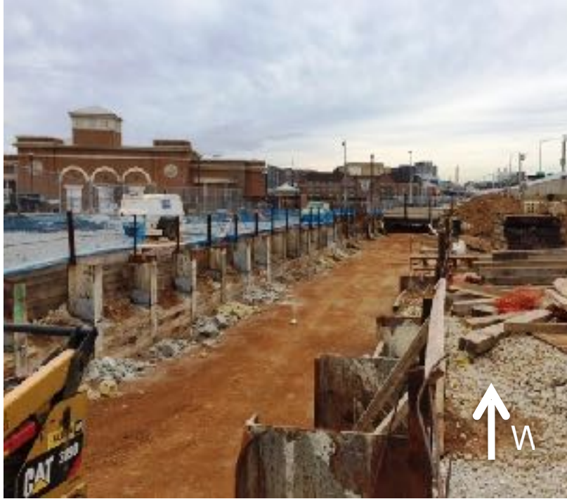
Backfilling Phase I Tunnel

Backfilling Phase I Tunnel, and 8th Street Phase II Temporary Bridge Deck