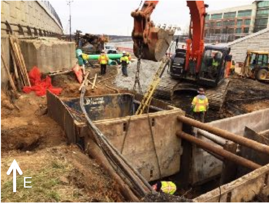
Phase II 12th Street Sewer Relocation

Drainage, Tunnel Abatement, and Bracket Pile Drilling Prep