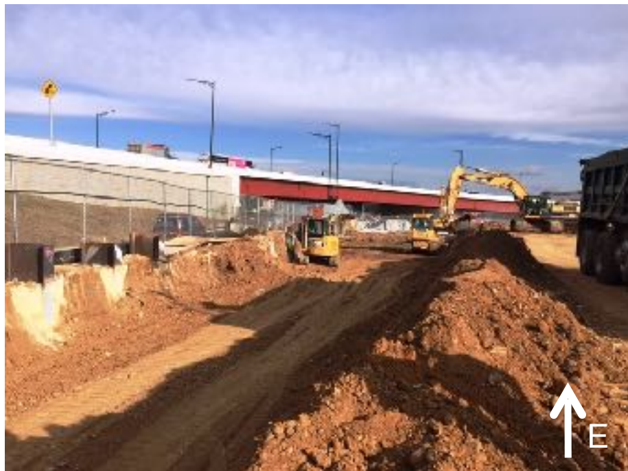
Excavation to Old Tunnel Arch